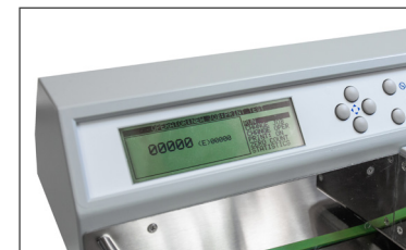
5.5" Digital Display